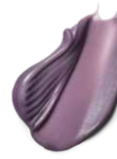
9-12 PLATINUM GREY