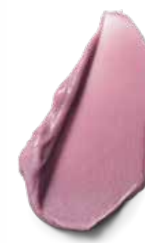
9.5-19 DUSTY PINK