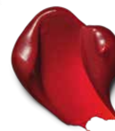
6-88 RUBY RED