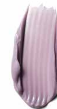
9.5-1 PEARL SILVER