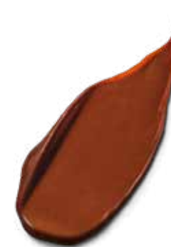
6-46 RAW CACAO