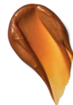
8-46 GLAZED CARAMEL