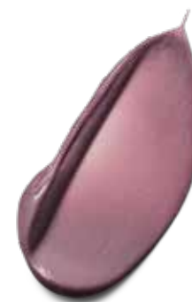
8-19 FROSTED LAVENDER