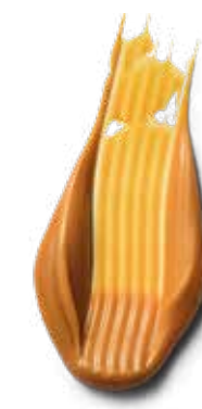
9.5-4 BEIGE SAND