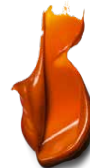
7-77 BRIGHT COPPER